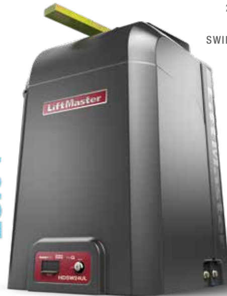
CAPACITIES STANDARD ARM